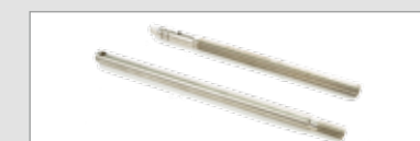
spindle | push rod