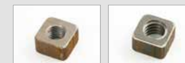
nut fine thread