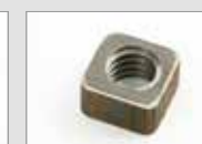
nut trapeziodal thread